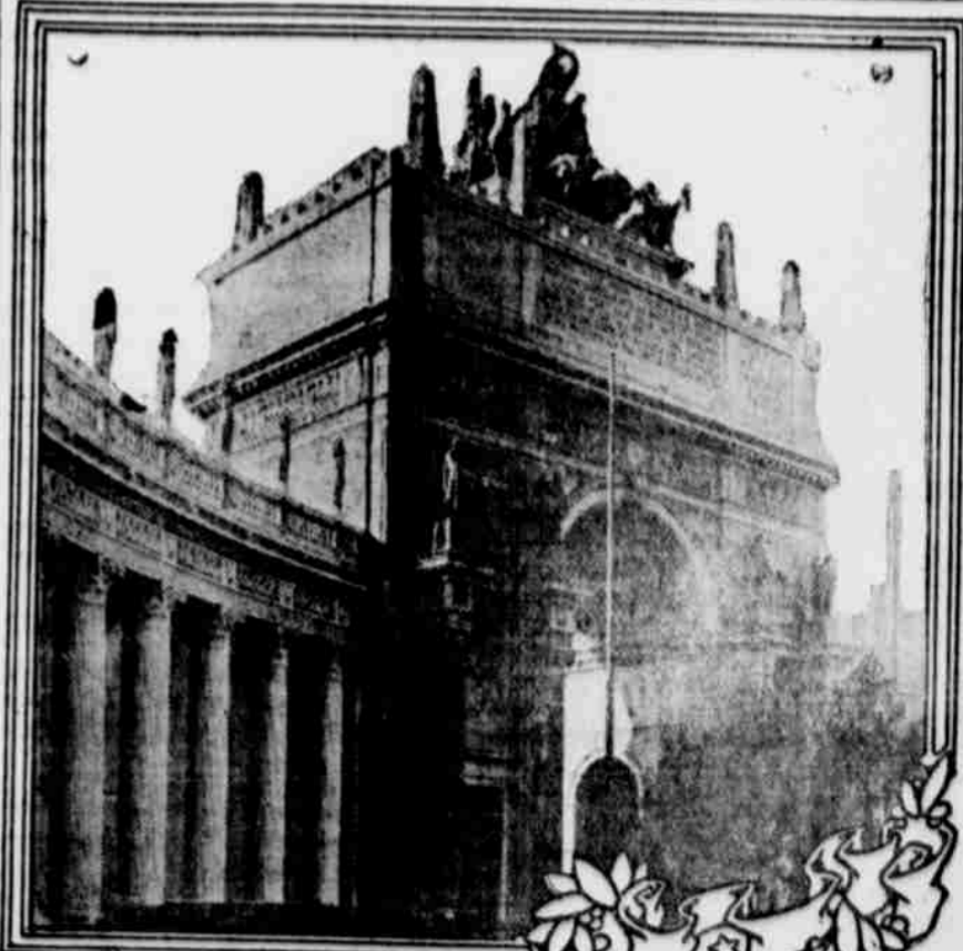
VAST TRIUMPHAL ARCH AT THE WORLD'S GREATEST EXPOSITION, THE PANAMA-PACIFIC INTERNATIONAL EXPOSITION, SAN FRANCISCO, 1915.

This photograph shows James Earle Fraser's superb piece of statuary, "The End of the Trail," at the Panama-Pacific International Exposition. More than 800 beautiful sculptures are shown at the Exposition, the works of famous sculptors of the day. In addition to the sculptures shown out of doors, thousands of beautiful works of art are presented in the great Palace of Fine Arts.