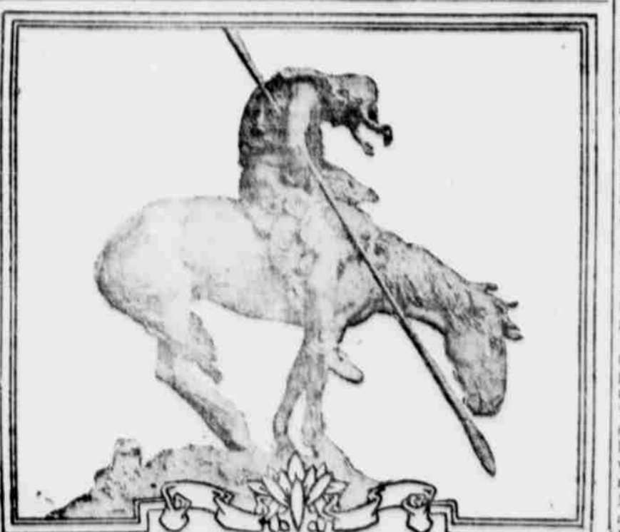
"THE END OF THE TRAIL," PANAMA-PACIFIC INTERNATIONAL EXPOSITION, SAN FRANCISCO, 1915.

er arm, will raise sightseers more than 325 feet above San Francisco bay, affording an unsurpassed view of the Exposition City and the Golden Gate. Apart from the amusements, conventions and congresses, the vast pageants, the superb pavilions of the nations and the magnificent state buildings, the Exposition itself is a sight well worth seeing. The giant exhibit palaces, the loftiest and most imposing exposition buildings ever constructed, are in their architecture representative of the finest work of a commission of famous American architects, who freely collaborated with distinguished members of this profession abroad.