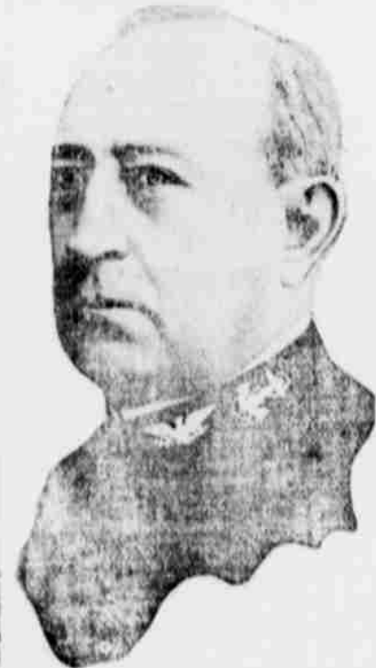
CAPTAIN HUGH RODMAN.

As soon as a ship moves toward the canal its wireless and all signal arrangements will be under the immediate