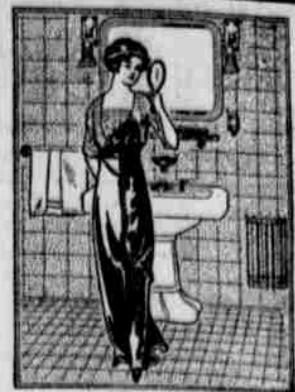
"Standard" "Kenroyd" Lavatory