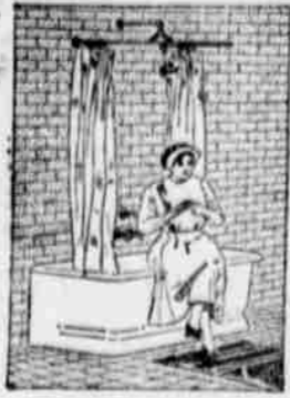
"Standard" "Calmor" Bath