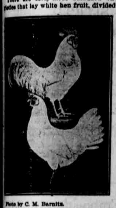
VINS LEGHORNS, WORLD CHAMPION

No use talking, the pure white egg is beauty, and the craze for it is so exreding that it will soon be national. Fertunately, the white egg layers are te most prolific and so numerous. There are forty-three standard va