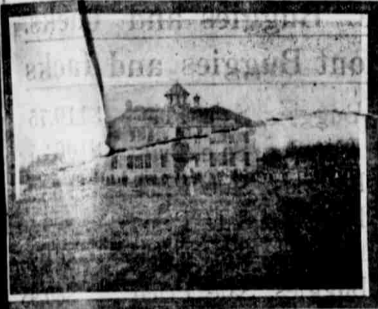
THE WEST SIDE GRADE SCHOOL

BEFORE YOU BUY A HOME look over Ontario, the rising point of Eastern Oregon and the center of a vast