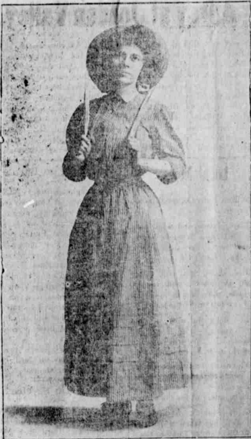
Ontario Ontario Opera House, Thursday, Dec. 9.