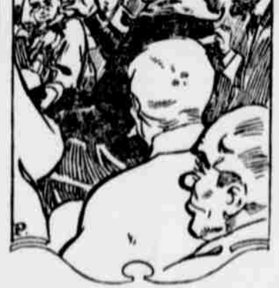
THE MINER LIFTED HIMSELF OUT OF HIS SEAT.

At every evening performance there would be several score of them in the best seats in the house.