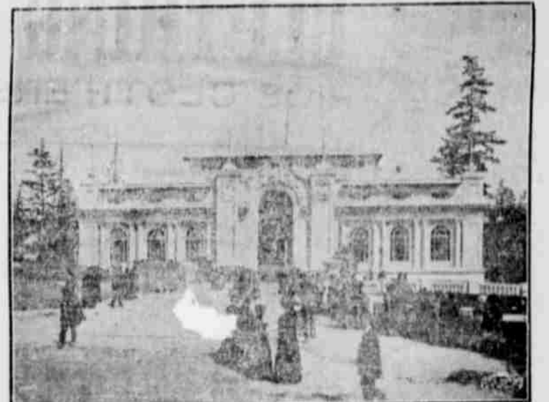
THE HAWAIIAN BUILDING, A-Y-P. EXPOSITION, SEATTLE.

The building erected at the Alaska-Yukon-Pacific Exposition for the exclusive use of the Hawaiian Islands, occupies a prominent position on the Court of Honor next the central government structure. Hawaii has prepared a more extensive and comprehensive exhibit of its marvelous resources than for any other world's fair. It will show all of its native fruits and vegetables; will offer an aquarium of live fish, and in various other ways interest the fair visitors. Fruits will be served by native girls and native orchestras and singers will be always on hand. A tank in the center of the structure will show the islands as they rest in the Pacific Ocean. Upwards of $100,000 has been expended in assembling Hawaii's display.