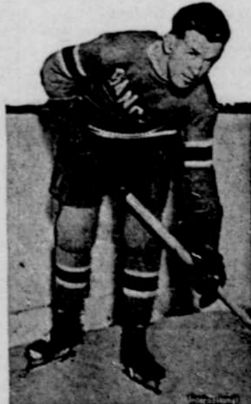
Frank Boucher, above, stellar center of the New York Rangers, who has repeated last season's performance of winning the Lady Byng trophy. The trophy, presented by Lady Byng, is awarded each year to the player in the National Hockey league who combines skill and sportsmanship to the highest degree.