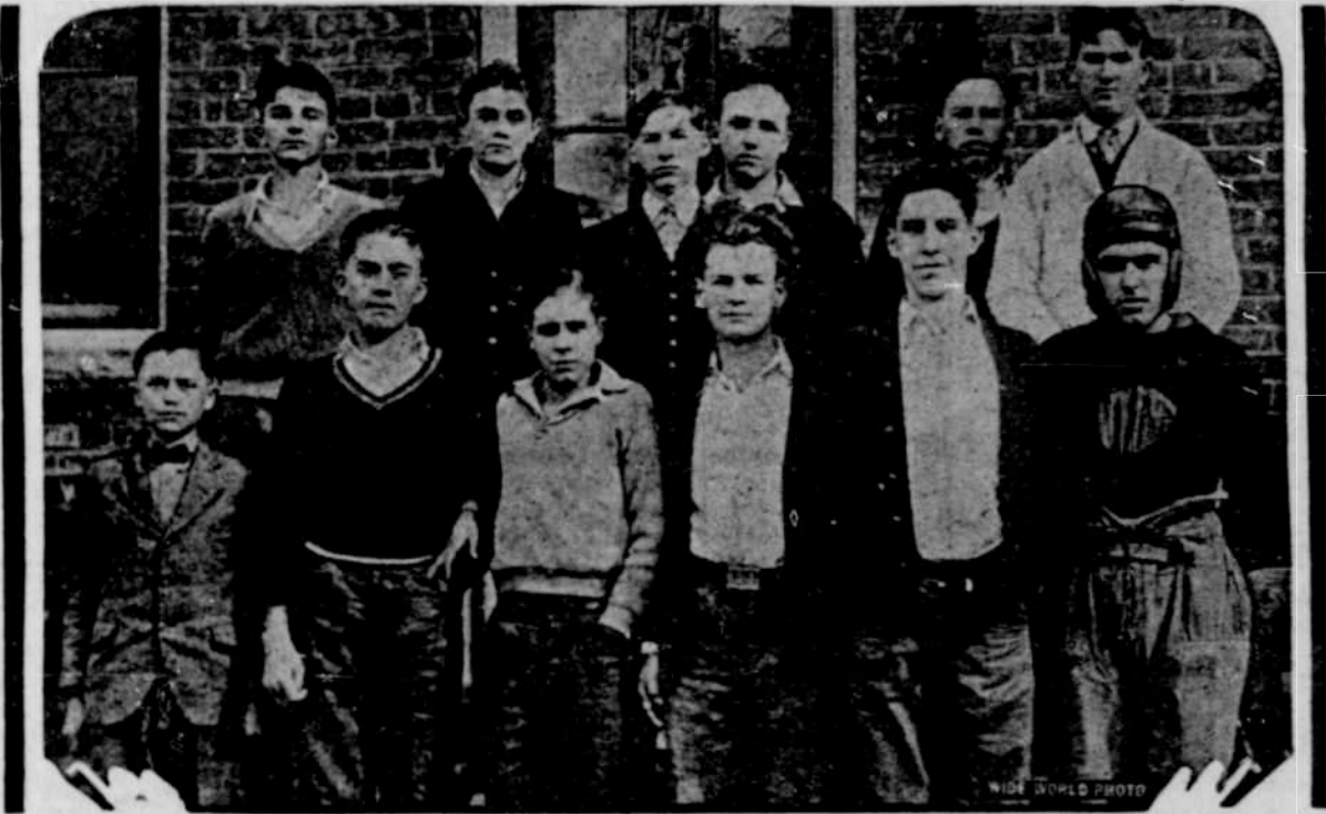
These twelve students at Berea college, in Kentucky, are all named after the late Woodrow Wilson. Eleven of them are Kentuckians and the other is from West Virginia.