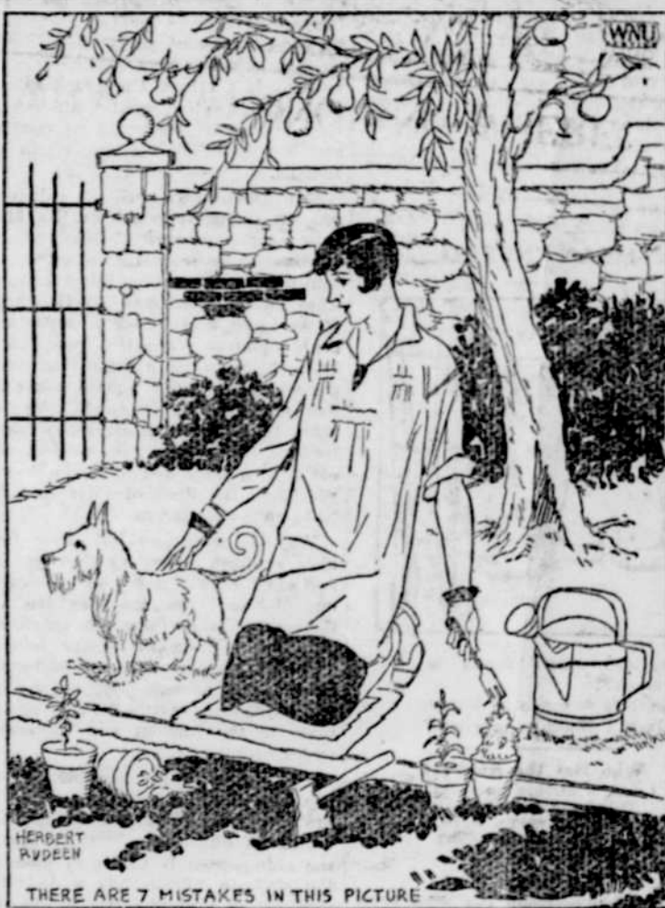
How good are you at finding mistakes? The artist has intentionally made several obvious ones in drawing the above picture. Some of them are easily discovered, others may be hard. See how long it will take YOU to find them.