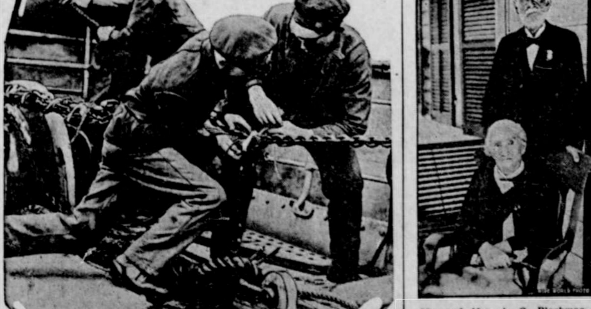
Several Atlantic cables were broken by the recent earthquake off the New England and Newfoundland coast. These men aboard the cable ship Cyrus Field are engaged in the difficult task of bringing up the broken ends and splicing them.