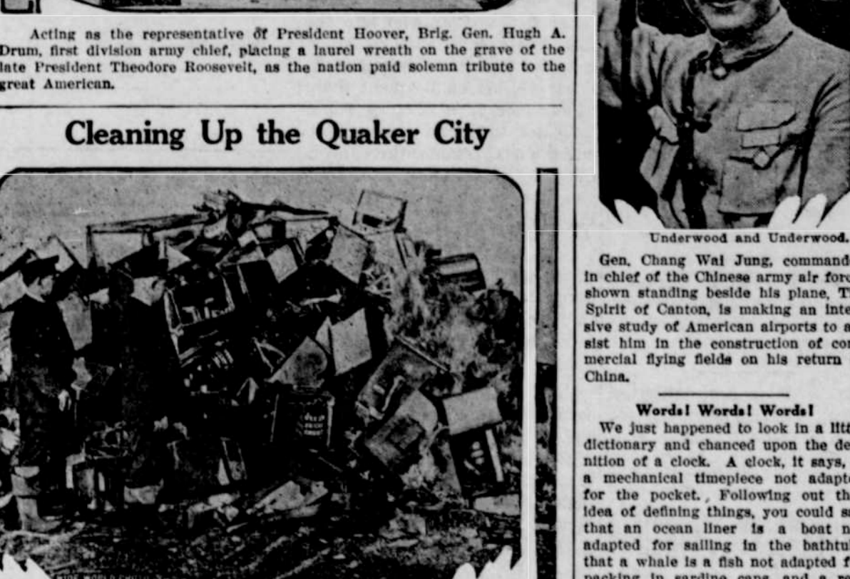
Philadelphia police burning various gambling devices seized during raids in the Quaker city.