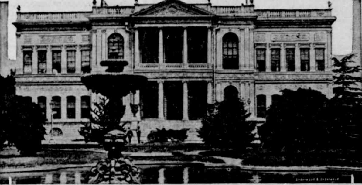
Here is what may be the most magnificent dance hall in the world—the Dolma Bagtche palace, former dwelling of the sultan and caliph and their numerous concubines. Because there is a growing craze for modern dancing in Turkey, citizens and officials have appealed to the president to turn the palace into a modern ballroom.