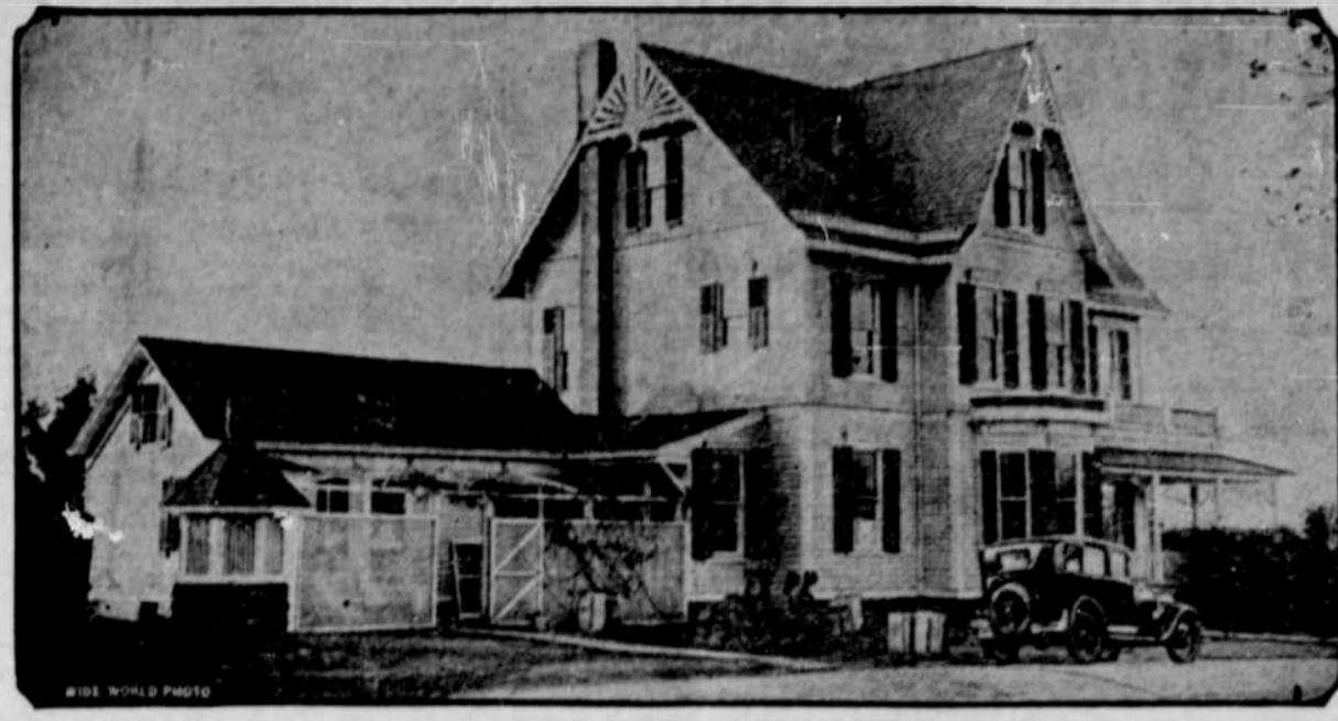
The former Oscar Hammerstein home at Hillside, N. J., which was raided by federal agents after they learned that a huge liquor syndicate had converted it into an armed fortress and made it a base of operations.