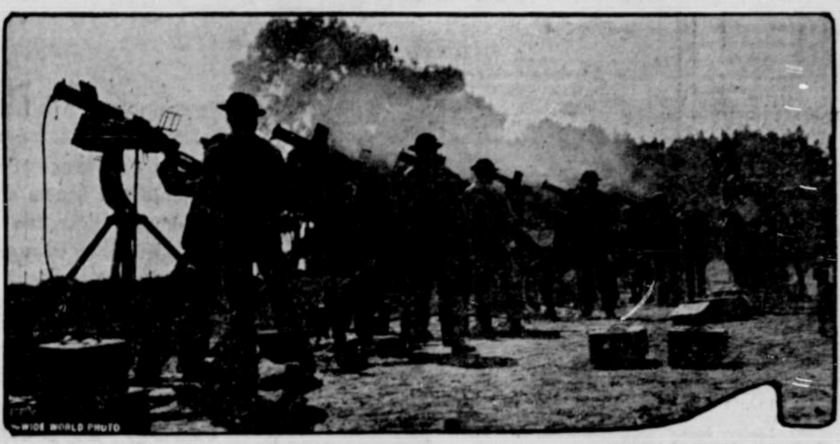
Machine gun battery of the Sixty-third Coast artillery from the Presidio at San Francisco shooting at a moving target one-half mile away and in range for 15 seconds. These Browning guns throw 605 rounds of 30-30 ammunition per minute. Accuracy is deadly.