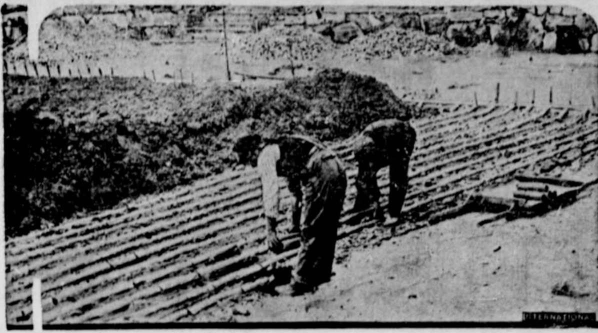
Sweden has adopted electric gardening with success. These workers are laying brick pipes through which the wires are passed. The wires, when electrified, warm the soil and crops of vegetables flourish that ordinarily grow only in hothouses.