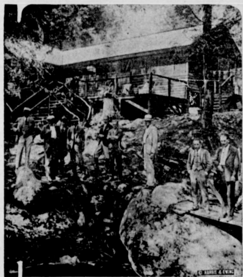
Newspaper correspondents along with photographers finally have been admitted to President Hoover's fishing camp in the Blue Ridge mountains of Virginia, and this is one of the first pictures they made there. It shows the "summer White House" itself in its picturesque setting.