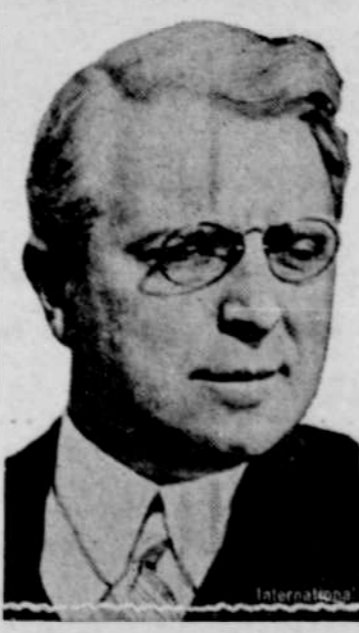
John N. Willys, who has retired from active work as an automobile manufacturer, is mentioned as likely to be appointed ambassador to Turkey.