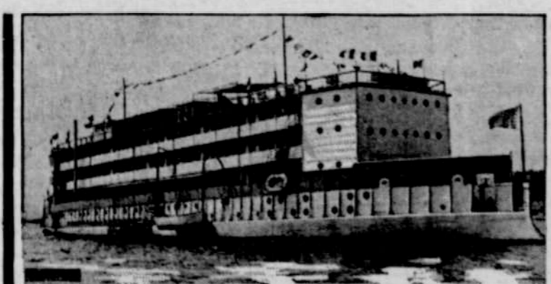
The Amphitrite, formerly the U. S. S. Monitor which helped guard New York harbor during the World war, is now a fashionable floating "country" club, at anchor off Fort Washington, Long Island.