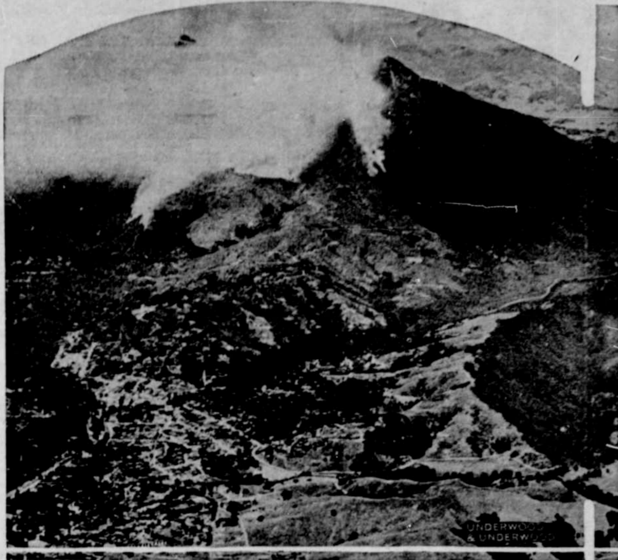
Here is a remarkable airplane view of the recent forest fire that swept up the slopes of Mt. Tamalpais, California, and destroyed the tavern on the top of the mountain.