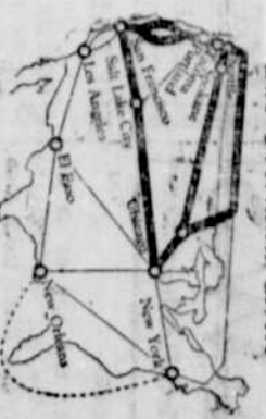
The Overland Circle

From Los Angeles to Chicago, "Golden State Limited" in 67 1/2 hours, spends before you the historic Southwest; glimpse of Old Mexico at Juarez, 3 minutes from El Paso. Thence to Kansas City, Chicago & midwest points.