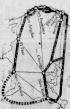
The Sunset Circle

Any trip East can be a Circle Trip —if you go via Southern Pacific, through California and circle back over Northern lines. This summer get more for your travel funds. No matter what your eastern destination go one way, return another. You can see the whole Pacific Coast and much of the United States at only slightly higher rate. Enjoy coast-to-coast service over the spectacular SOUTHERN PACIFIC. Enjoy coast-to-coast service over the spectacular SOUTHERN PACIFIC. Enjoy coast-to-coast service over the spectacular SOUTHERN PACIFIC. Enjoy coast-to-coast service over the spectacular SOUTHERN PACIFIC.