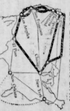
The Golden State Circle

Round the rim of the United States! First on the "Sunset Limited," famed round the world via El Paso and the old Santa Fe route, romantic New Orleans. Then by rail or at no more cost (excursion and berth included in your rail fare) enjoy 100 golden hours at sea to New York by Southern Pacific Steamship.