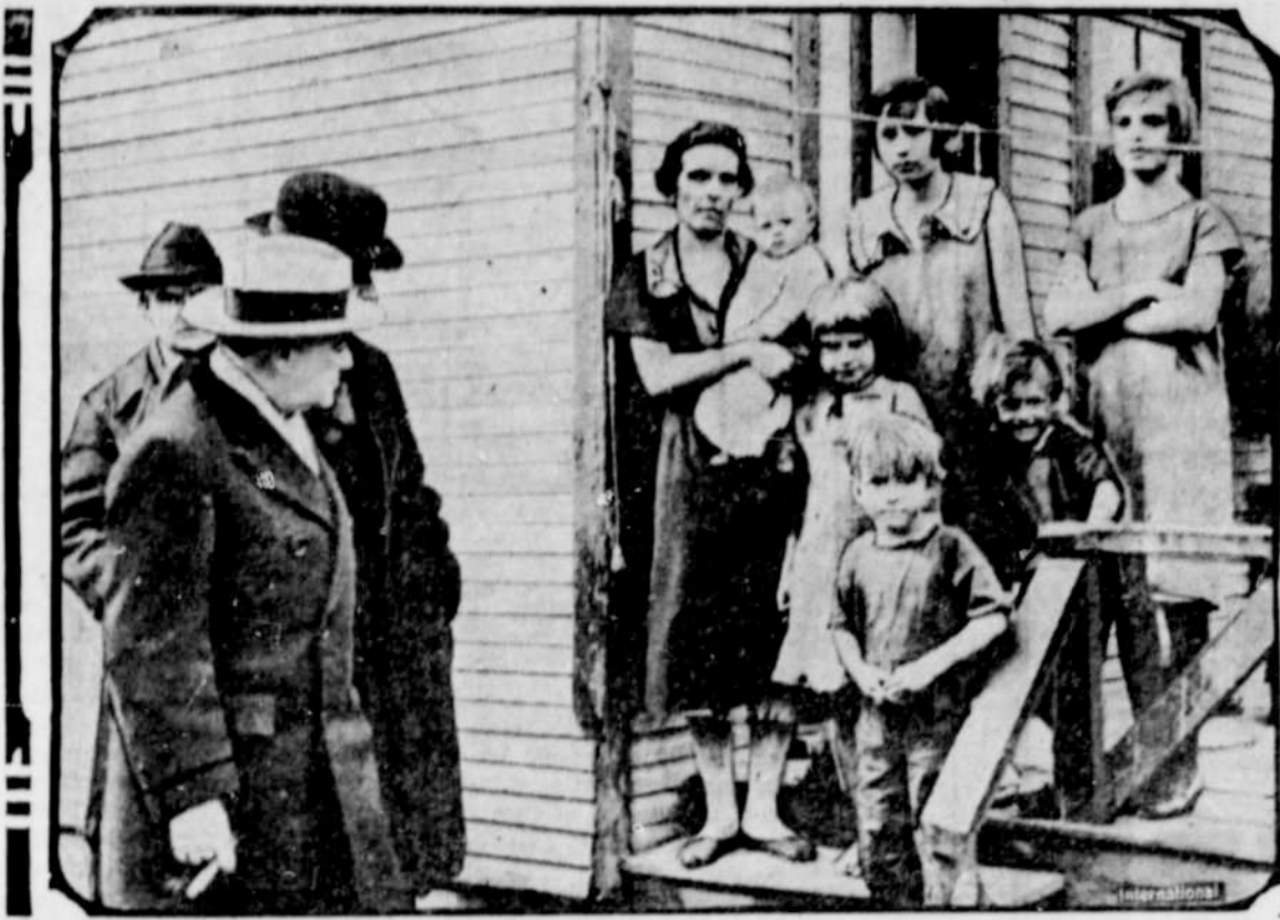
Members of the senatorial subcommittee investigating conditions in the bituminous coal field of Pennsylvania, talking to the family of a nonunion miner at Pricedale, Senator Wagner of New York, seeing one of the little girls was without shoes and stockings, gave her a five-dollar bill.