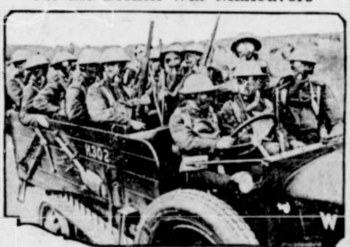
Britain's new war machine, the mechanised force, had its first intensive field training on Salisbury plain recently. Photograph shows gas-masked members of the infantry passing through the gas area.