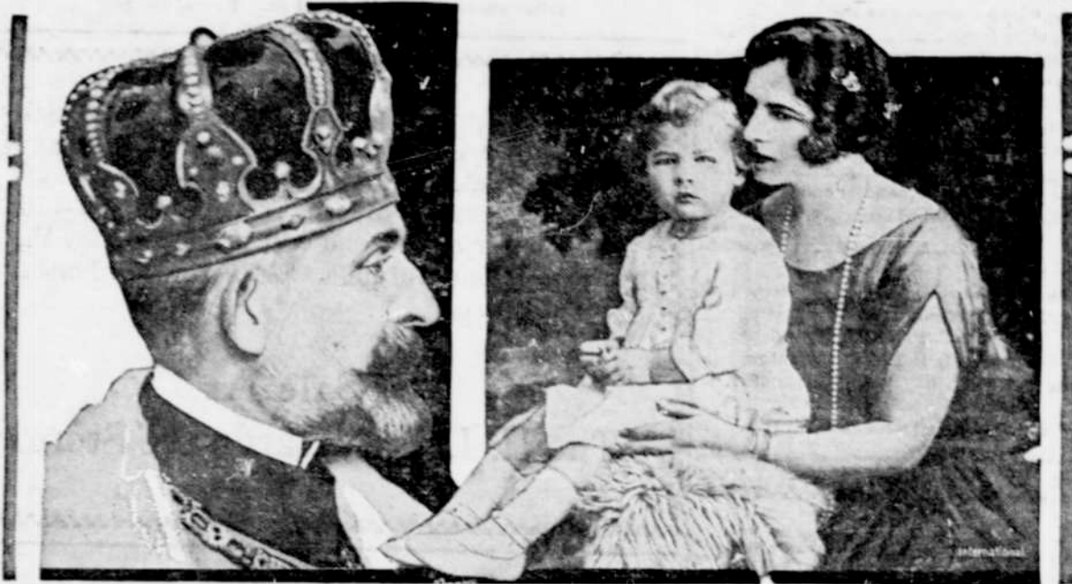
Left to right: King Ferdinand of Rumania; and Princess Helen, deserted wife of Prince Carol, with her son, Prince Michael, who was declared the legal successor to the throne.