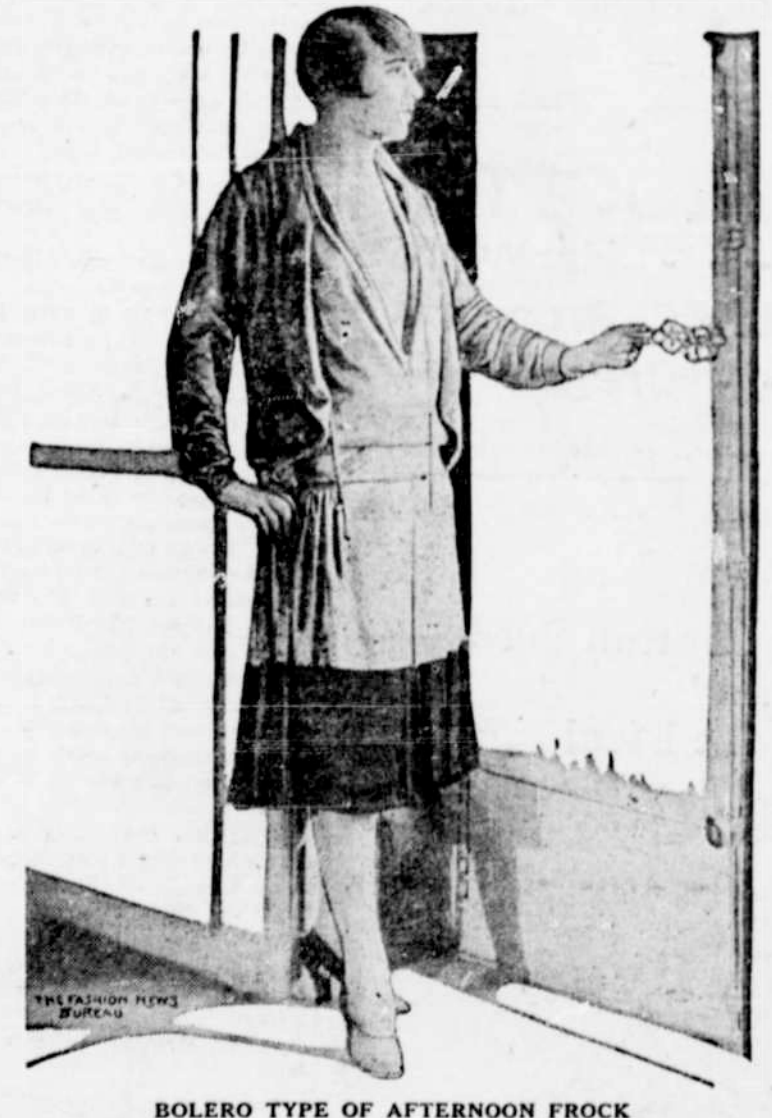
BOLERO TYPE OF AFTERNOON FROCK

It is most timely that these cunning little jacket effects be introduced into the scheme of dress design at this moment, for the trend of the mode is