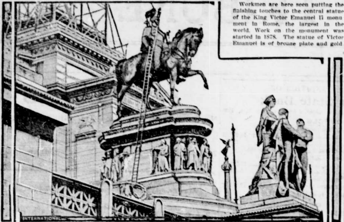
Workmen are here seen putting the finishing touches to the central statue of the King Victor Emmanuel II monument in Rome, the largest in the world. Work on the monument was started in 1878. The statue of Victor Emmanuel is of bronze plate and gold.