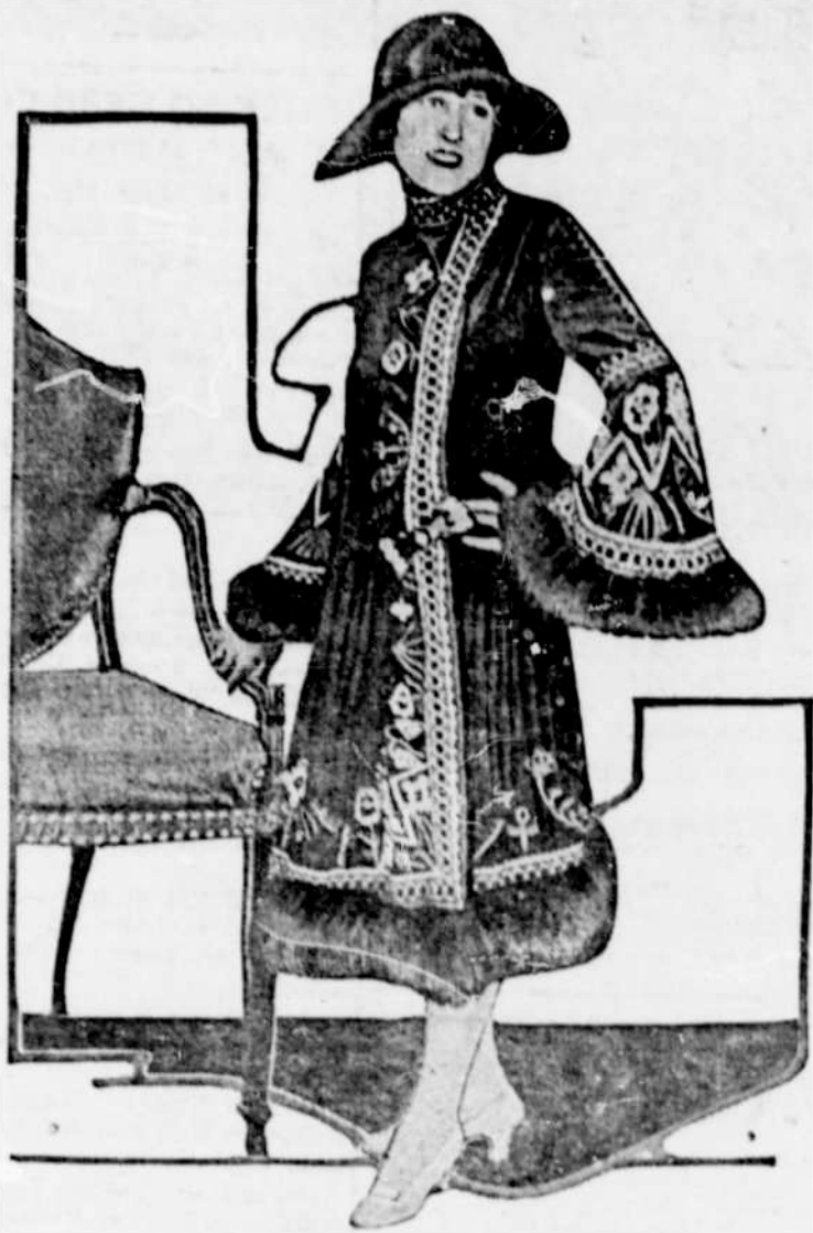
CHARMING FROCK WITH BELL SLEEVES

in regard to this subject. Throughout the styling of not only dresses but suits as well, the bolero is taken as a matter of fact. Designers are creating many versions in the name of bolero, some of which employ the all-around treatment, some with open backs, others much longer than those we have been accustomed to seeing. Advance reports from abroad are to the effect that the bolero, which at present is playing so important a role in not only afternoon but evening