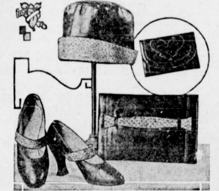
A MATCHED SET

gown with all the grace of a befringed Hawaiian maiden's dancing frock. Metal embroidery is also generously bestowed on the black satin frock, also rhinestone buttons and clasps whose sparkling beauty lend a note of enchantment to the modern all-black frock. This vogue for rhinestone embellishment is becoming more and more pronounced, not only for evening but for daytime costume as well. In the exquisite matching kidskin sets of hat, shoes and handbag, which is the latest sensation in style, opportunity knocketh at the door of the fashionable woman to spend and spend. Whatever these elegant combinations may cost, they are worth it, for they glorify even the simplest costume to the point of sartorial perfection. der-arm bags, and the coloring is repeated in the shoes. Inaid leather work has become very popular for novelty footwear, and it lends itself delightfully to the new leather accessory sets, such as pictured here. With solid colored leathers for the foundation, it is an inspiration to the designer to be able to work in details of the fanciful inset leather, and to thus interrelate these accessories until the costume appears in perfect ensemble. Thus, milady finds she is required to be very discriminating in selection of headwear and footwear with all the other trifles incidental to attire, for either these must be a perfect match or at least maintain a pleasing harmony.