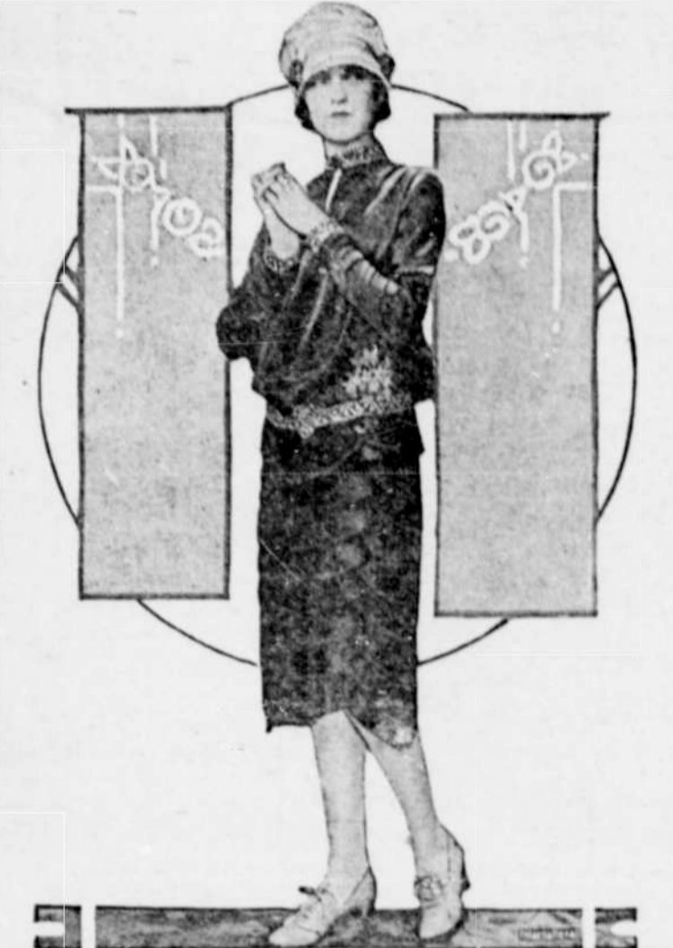
OF DISTINCTIVE MODISHNESS

The fact that the ensemble theme is prevalent in the mind of the stylist this season, accounts for the being of the handsomely designed group in this picture. This adorable set is of ebony kidskin—the new name Paris has given to black kid. With the revival of the vogue for fabrics in black, it is natural to foresee the incoming of the mode for black shoes. Ebony kid in its deep dull luster is considered far smarter than the leather of high gloss. Here we have a naive hat of ebony kid with a narrow turn-back of gray snakeskin. The flat envelope purse is displayed in two views. The one in the inset shows the handsome front flap which is embellished with a conventional perforated design, the same