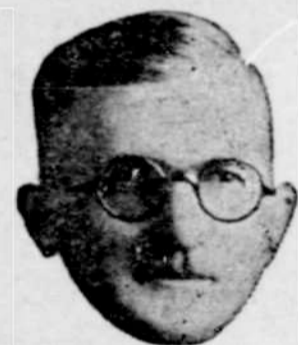
Raymond Smith says:—

1/2 PRICE INTRODUCED 1/2 DRY OFFER TO DIABETICS Money Back if Not Satisfied