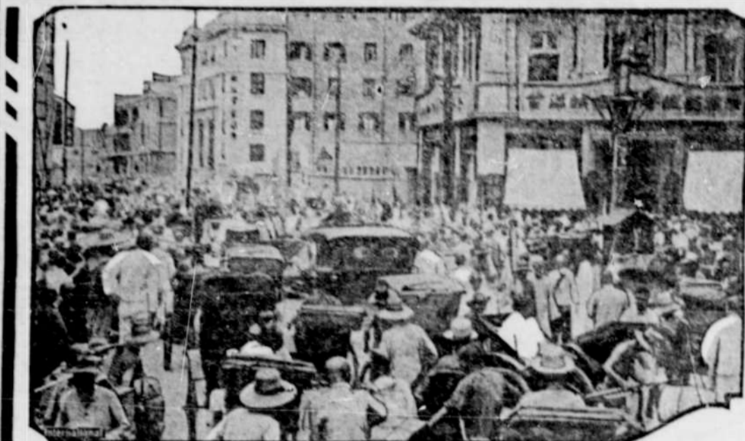
This picture of the civil war in China shows some of the hundreds of thousands of people in Hankow fleeing to the British concession to escape the Red troops of Canton.