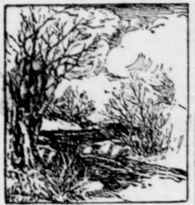
Wishing for Summer Time.

THE little bare bushes beside the brook shivered as the wind blew across the meadow. For it was winter time, and all about could be seen the touch of winter's icy hand. "Oh, will it ever be summer time again," steeled one bush, which was a little taller than the others. "To think of my pretty green leaves and the grass so green, only a short time ago, and now all is bare and cold. Oh, dear, oh, dear." All the other bushes began to sigh and sigh, too. "Oh, dear, oh, dear—"