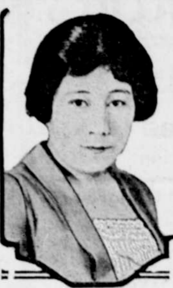
Tsuru Aoki is the charming little wife of Sessue Hayakawa, the movie star. After an absence of many years from the screen she was recently induced to return to play opposite her husband in one of his big productions. She has been deeply interested in Hayakawa's work of translating Shakespeare's plays into the Japanese language.