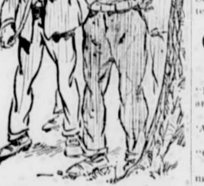
"Let's Do the Thing Right." rope he was swung off his feet. As the crowd turned to leave, some one fired a shot at the body hanging in the moonlight and instantly a fireball was fired. The body was killed.

He was then placed on a high gate and with several men pulling on the