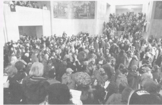
Hundreds filled the Capitol Rotunda sending a strong message to legislators during the February session