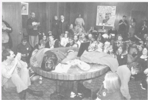
We staged a sit-in at the Governor's office.