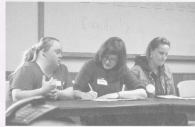
We had our first-ever Lobby Day dedicated to people with developmental disabilities and mental health issues.