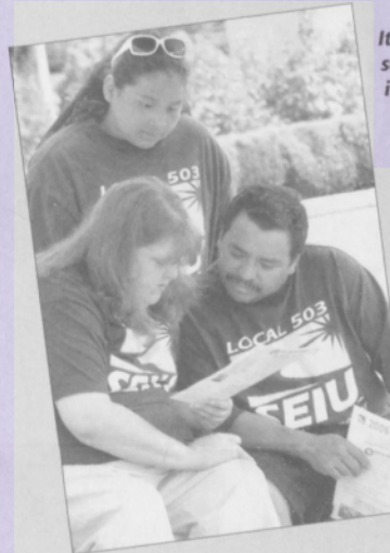
Members in Medford send a strong message by purpling up.

It all starts with members completing bargaining surveys so the bargaining team knows which issues are most important.