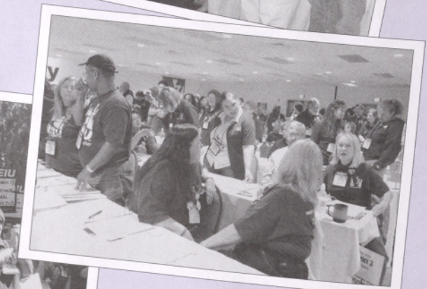
Votes on some resolutions were too close to call and required a standing vote.