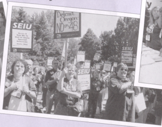
Members participate in a solidarity action against Measures 41 and 48.

voice vision victory SEIU LOCAL 503 2006 General Council