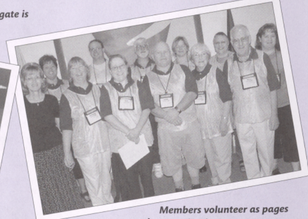
Members volunteer as pages and sergeants-at-arms.