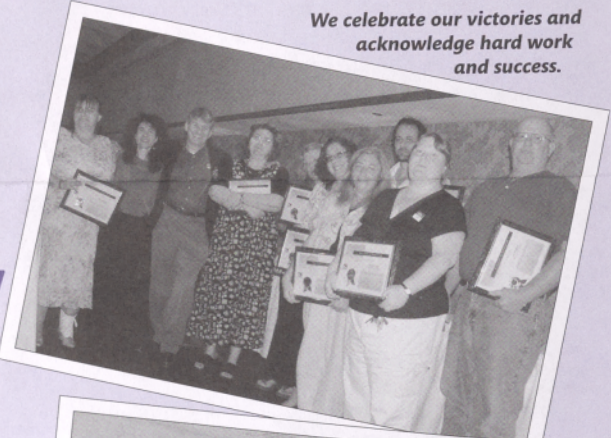
We celebrate our victories and acknowledge hard work and success.