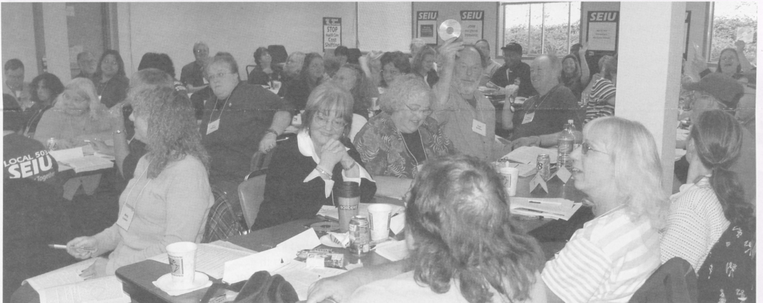
Almost 60 DAS Stewards spent September 24 in training on the new contract language. The online contracts should be available early in October; printed copies will be available in early November.

SEIU Local 503, OPEU PO Box 12159, Salem, OR 97309-0159