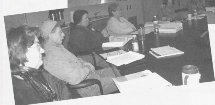
OUS non-economic bargaining began Feb 4.