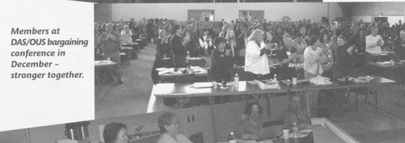
Members at DAS/OUS bargaining conference in December - stronger together.