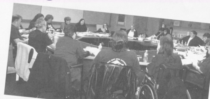
Workers' Comp is the big issue for homecare.

Don't forget to purple up on Wednesdays and bargaining days.