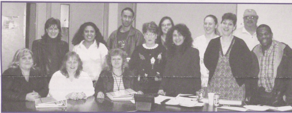
Bargaining Team members from Evergreen nursing homes begin historic first contract negotiations.