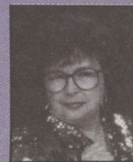
Rita A. Sparks Homecare, Local 099

I'm ready to suspend my current political obligations, and I've obtained a reliable vehicle for the 70-miles commute to Salem.