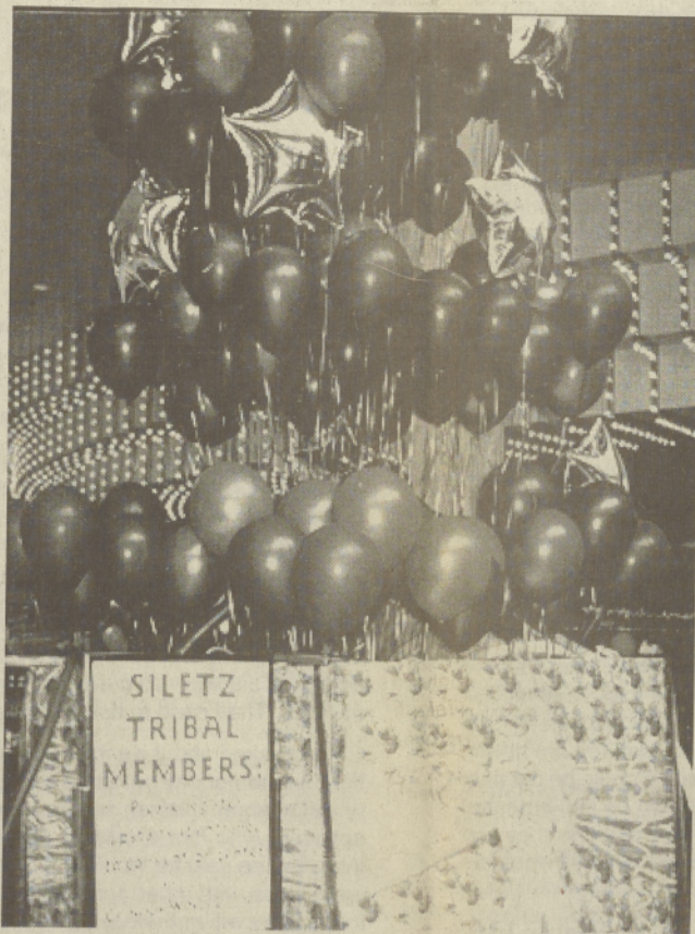
The Welcome Table & Ballons at Birthday!!!