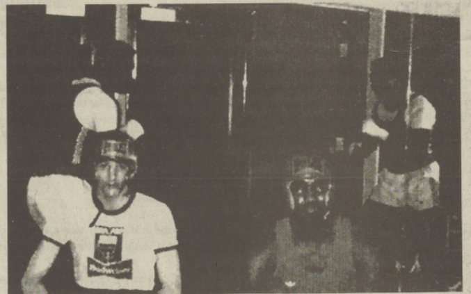
Tye seen here at U.S. Olympic Team Training camp, with Evander Holyfield when Evander still had both ears!!!!