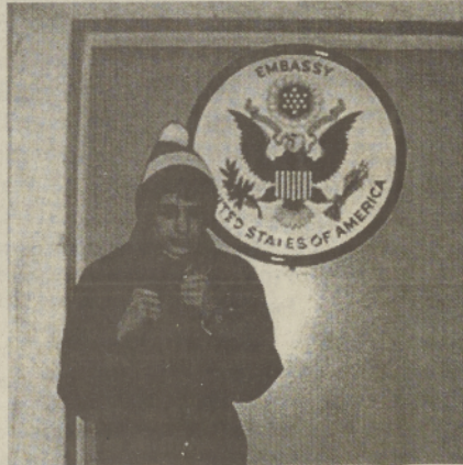
Tye at the Winter Olympics