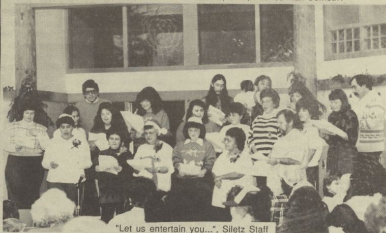
"Let us entertain you...", Siletz Staff