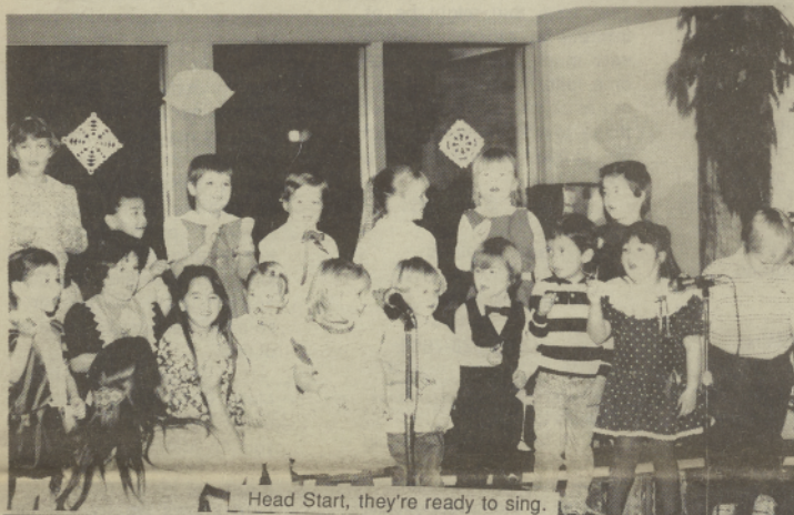
Head Start, they're ready to sing.