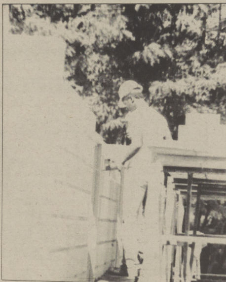
Job Corps member lays bricks