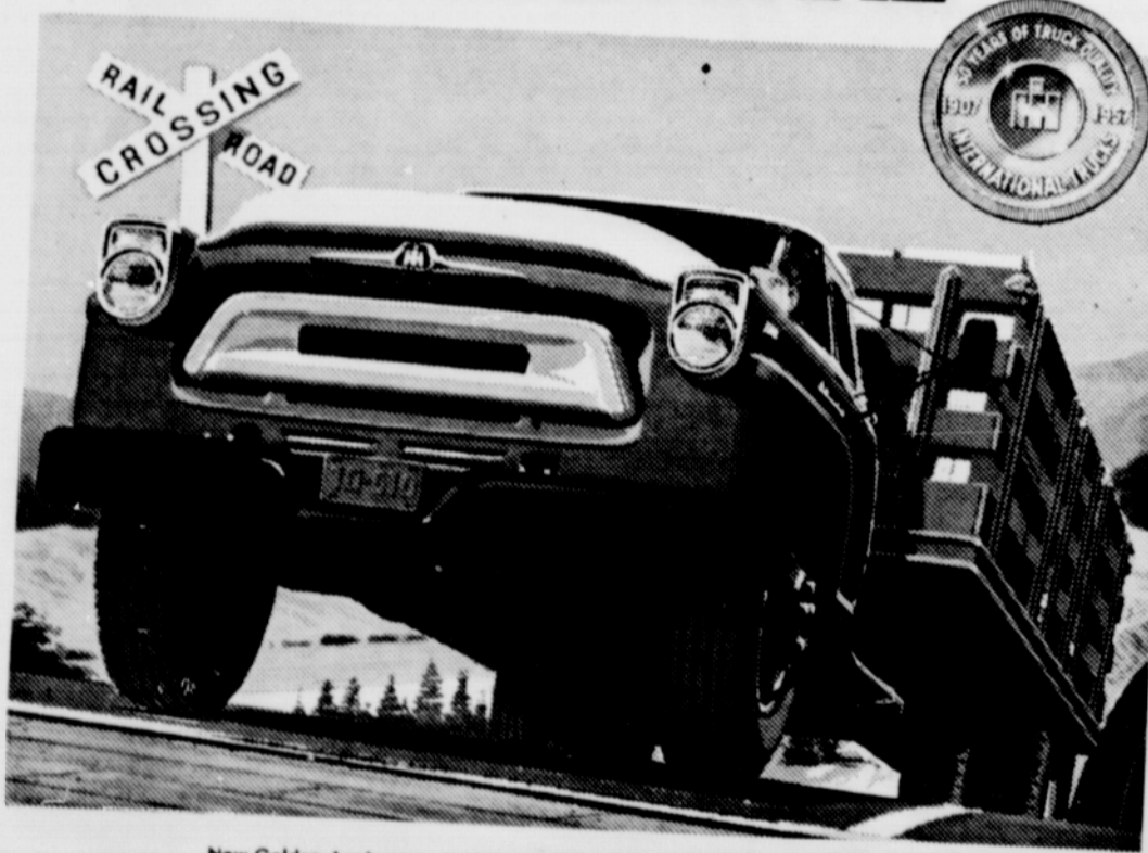
New Golden Anniversary INTERNATIONALS range from Pickups to 33,000 lbs. GVW six-wheelers. Other INTERNATIONALS, to 96,000 lbs. GVW, round out world's most complete line.

There's plenty of action under the hood of every new Golden Anniversary INTERNATIONAL Truck.