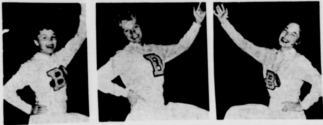
HERE ARE THREE OF THE BROOKINGS YELL LEADERS trying to root the team home to a victory. The Bruins lost Saturday by one point, despite the cheering though. They face Illinois Valley in a league game here Saturday.