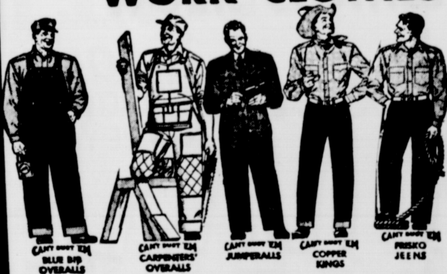
CANT BUST 'EM BLUE DEN OVERALLS