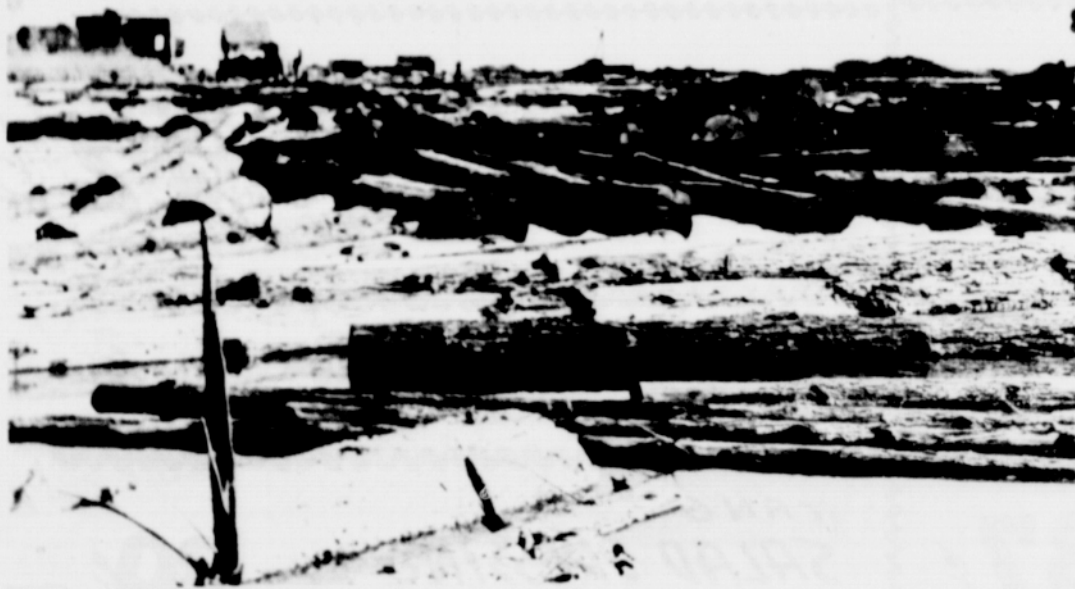
LOG PILE AT THE BROOKINGS PLYWOOD POND almost eliminates the pond entirely. Just about two years ago this pile of logs would have looked terrific to the Plywood, because logs were very hard to come by. Even now, however, the pond filled like this keeps at least one worry off the shoulders of the Plywooders.