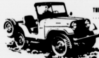
THE UNIVERSAL 'JEEP' ... does more jobs "anywhere-anytime".