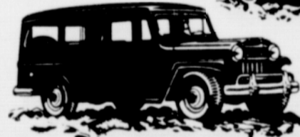
THE 'JEEP' UTILITY WAGON ... dual purpose vehicle for business or family.