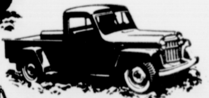
THE 'JEEP' TRUCK ... America's lowest priced 4-wheel drive truck.