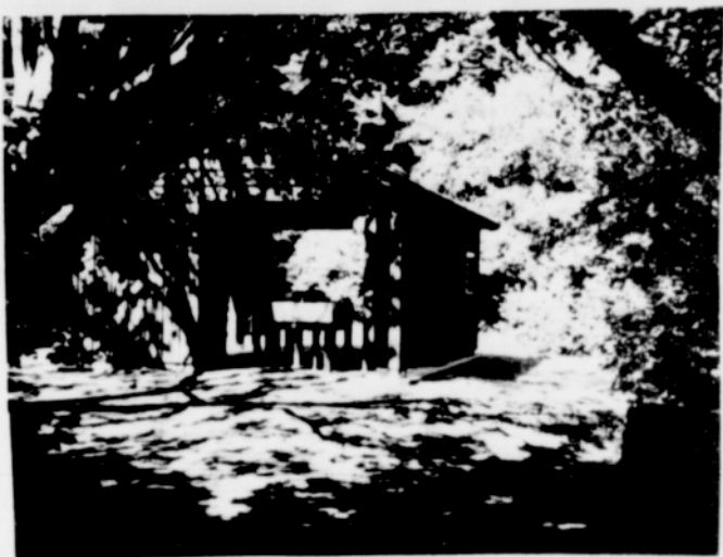
SCENES FROM AZALEA STATE PARK. One of the nicest spots in the area to relax is Azalea State Park, where the state has furnished beautiful Myrtle Wood tables and benches, besides many fireplaces to cook those outdoor meals, plus having real stove facilities available for tourists.