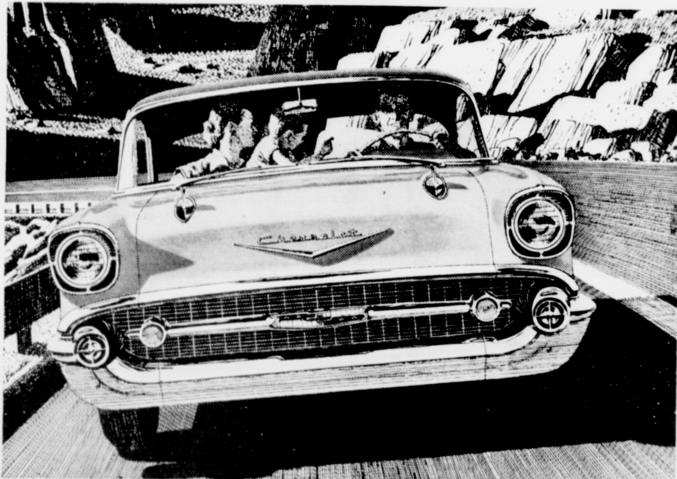
DON'T BUY ANY CAR BEFORE YOU DRIVE A CHEVY . . . ITS BEST SHOWROOM IS THE ROAD.

AIR CONDITIONING—TEMPERATURES MADE TO ORDER—AT NEW LOW COST. GET A DEMONSTRATION!