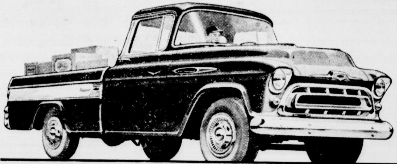
Brawny beauty that knows how to work—the high-styled Cameo Carrier!

Scholarship grades at Oregon Tech are based on the student's demonstrated ability in practical work, and classroom work in related technical subjects. Honor roll grades indicate work which is outstanding or of better than average achievement. A grade point of 4.0 shows work far above minimum standards of the Institute and is the highest grade given.