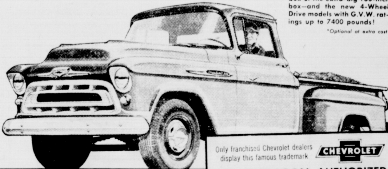
Here's the most popular pickup in America!

Only franchised Chevrolet dealers display this famous trademark