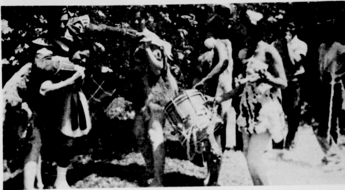
OUT OF TOWNERS PROVIDE ENTERTAINMENT at the Festival. Here the visiting princesses from Grants Pass, garbed in the Cave Men clothes indulge in some horse play with a member of the Eugene Bag Pipe band. The band was the hit of the festival.