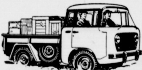
The New Forward Control 'Jeep' FC-150... puts a 74" pickup box on a wheelbase only 81" long.