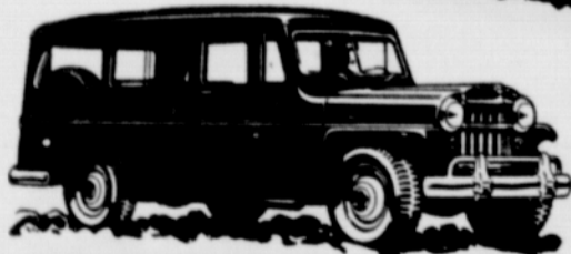
The 'Jeep' Utility Wagon... dual purpose vehicle for business and family.