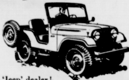
The Universal 'Jeep'... does hundreds of jobs.