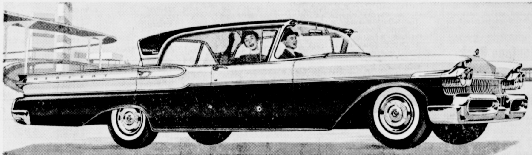
FIRST PRIZE EVERY WEEK—THE FABULOUS TURNPIKE CRUISER—THE MOST ADVANCED CAR AT ANY PRICE!

This meeting will be held with the Brookings Rotary Club. All district cooperators as well as others interested in conservation are invited to attend.