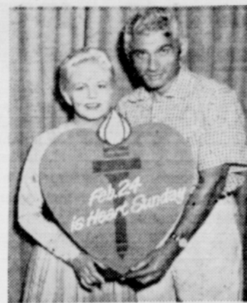
FILM STARS Peggy Lee and Jeff Chandler remind you that February 24 is Heart Sunday—the day on which a Heart Fund volunteer will call at your home.

Tansy Ragwort is a weed that has spread over thousands of acres in the county. It is particu-