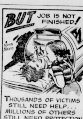
THOUSANDS OF VICTIMS STILL NEED HELP... MILLIONS OF OTHERS STILL NEED PROTECTION