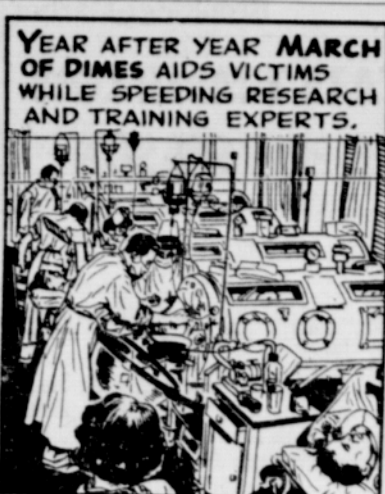
YEAR AFTER YEAR MARCH OF DIMES AIDS VICTIMS WHILE SPEEDING RESEARCH AND TRAINING EXPERTS.