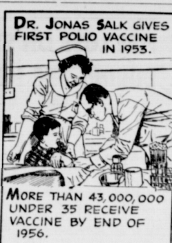
DR. JONAS SALK GIVES FIRST POLIO VACCINE IN 1953.