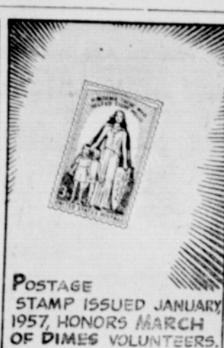
POSTAGE STAMP ISSUED JANUARY 1957, HONORS MARCH OF DIMES VOLUNTEERS.