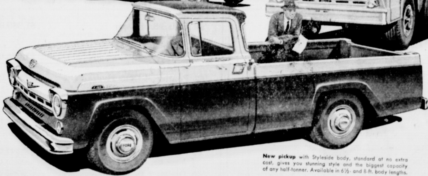
New pickup with Styleside body, standard at no extra cost, gives you stunning style and the biggest capacity of any half-tonner. Available in 6½- and 8-ft. body lengths.