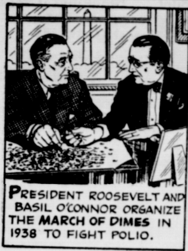
PRESIDENT ROOSEVELT AND BASIL O'CONNOR ORGANIZE THE MARCH OF DIMES IN 1938 TO FIGHT POLIO.