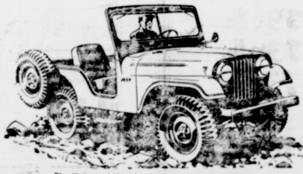
The 'Universal' Jeep... does hundreds of jobs.

Let us demonstrate the world's most useful vehicles