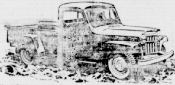
The 'Jeep' Truck... America's lowest-priced 4-wheel drive truck.