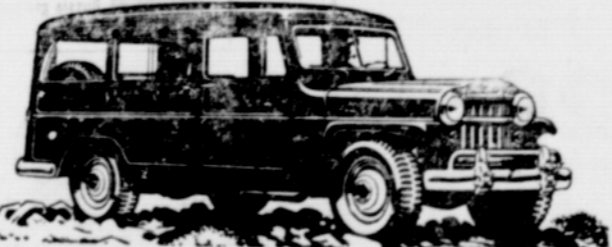
The 'Jeep' Utility Wagon... dual purpose vehicle for business and family.

It's good insurance and good business to own a vehicle that will help you get more work done every day in the year—that's a 'Jeep' 4-Wheel-Drive vehicle. On the highway, it travels at road speeds in 2-wheel drive—a simple shift gives the extra traction of 4-wheel drive for rough travel, on or off the roads. With power take-off, these rugged vehicles operate many kinds of special equipment. There's a 'Jeep' vehicle that will fill your specific needs and serve you best.