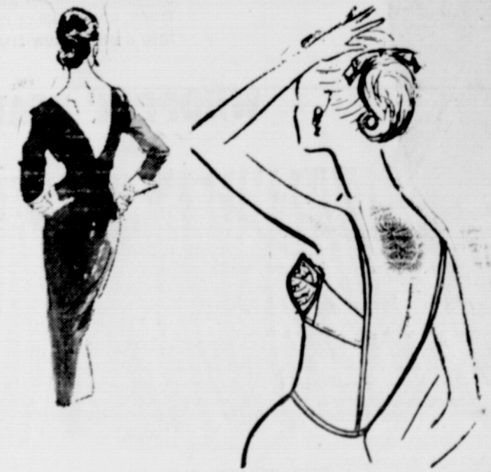
ALL EYES will be focused on the exciting new bare backed fashions that are slated to be seen from twilight to dawn this season. The problem of underpinnings posed by these new fashions, has been solved by Hollywood V-ette's new backless brassier in nylon alencon lace and satin. Velvety non-slip elastic is used for the adjustable shoulder straps that plunge to the waist in back, and are held securely by a narrow elastic belt that fastens around the natural waistline.